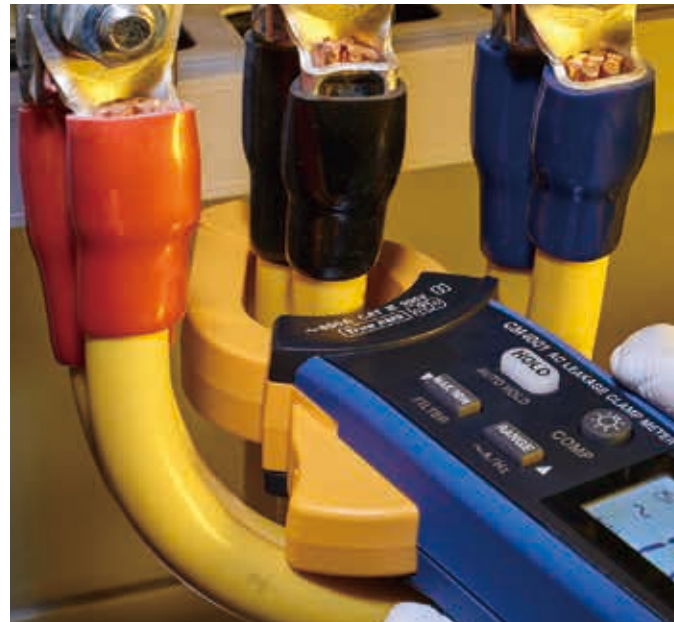
Clamp thick wires and double wires with narrow spacing smoothly